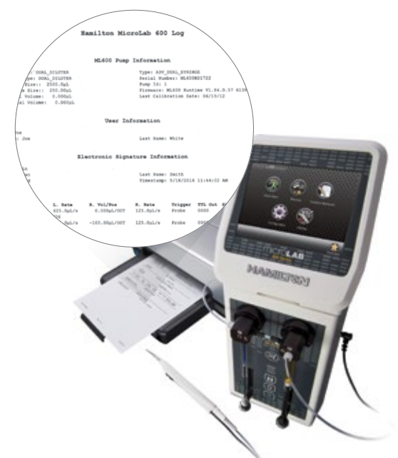
Figure 2: Printer Kit P/N 61500-04

The Microlab 600 has the ability to work with a 2D barcode reader. This barcode reader can be used to scan a sample ID, rather than manually input information. If log files are turned on, then this information will also be recorded in the log file.