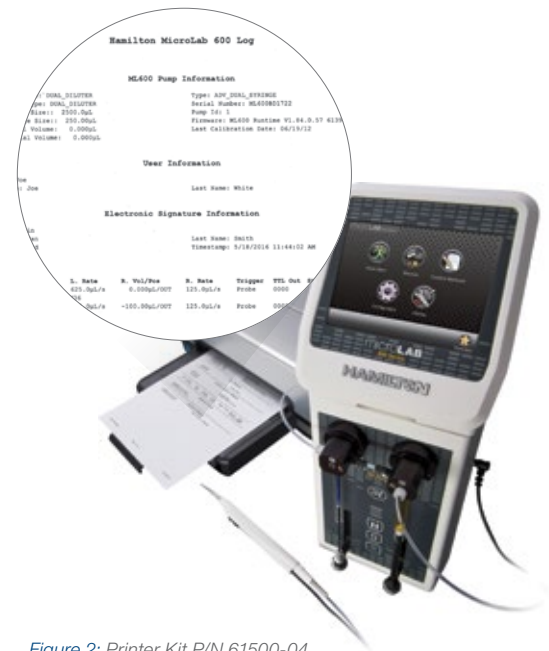
Figure 2: Printer Kit P/N 61500-04

Once user accounts are established, the log files can be turned on. This will keep track of everything that is done with the instrument and will automatically generate a log file. This log file includes user information, program information, configuration of the pump, etc. The log files may then be printed directly from the instrument using our printer kit (P/N 61500-04) which directly connects to the instrument.